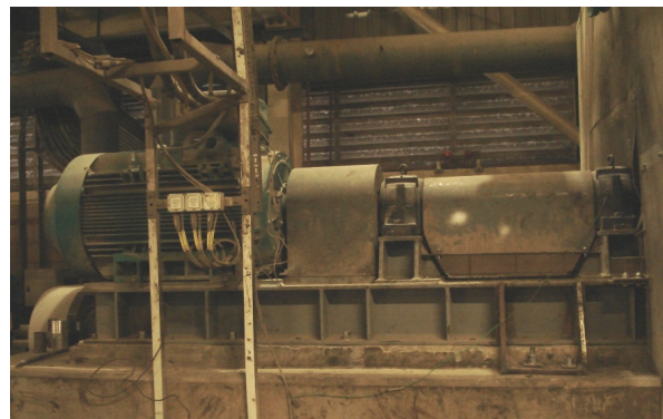
↑ Industrial Fan Unit